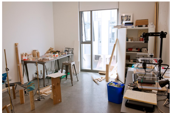
TOP View of Kate Moss' Studio BOTTOM View of Michelle Weinstein's Studio